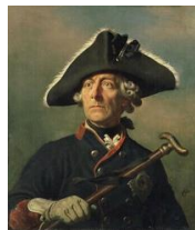
Friedrich der Große